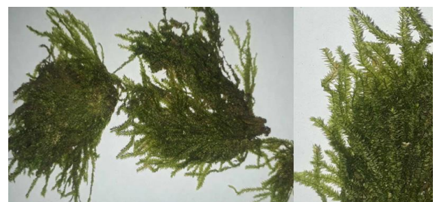
Figure 1: Morphological features of Vesicularia reticulata (Dozy & Molk.) Broth

The specimens were collected at the vicinity of Matin-aw Spring, Bangcud, Malaybalay City, Bukidnon on the 9th and 13th day of April 2024. Photo documentations were done on the collected species of moss at the vicinity of Matin-aw Spring. In addition, the taxonomic keys of moss were used in the identification of moss species with their corresponding morphological characteristics followed by the confirmation of samples done by, Dr. Andrea G. Azuelo, a bryologist. The following morphological features of each species was described above, namely: leaf color, leaf shape, leaf size, leaf margins, leaf apex, leaf base and leaf arrangement.