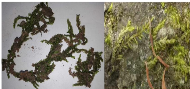
Figure 2: Morphological features of Ectropothecium monumentorum (Duby) Jaeg.