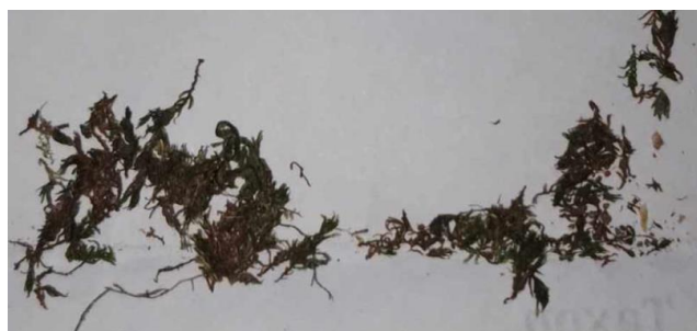
Figure 5: Morphological features of Fissidens guangdongensis Iwats. & Z.