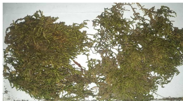
Figure 8: Morphological features of Entodon bandongiae (C.M.) Jaeg.