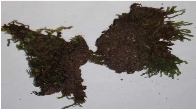
Figure 10: Morphological features of Philonotis imbricatula Mitt.