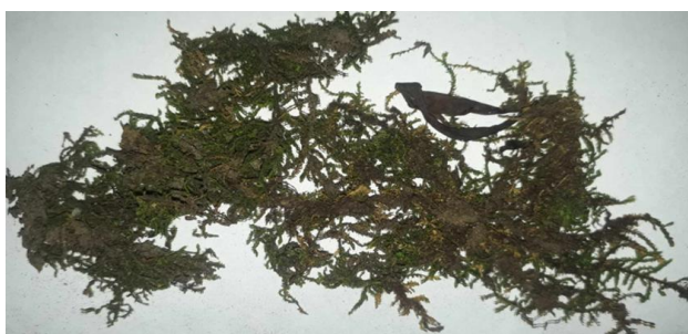
Figure 4: Morphological features of Rhacopilum schmidii (C.M.) Jaeg.