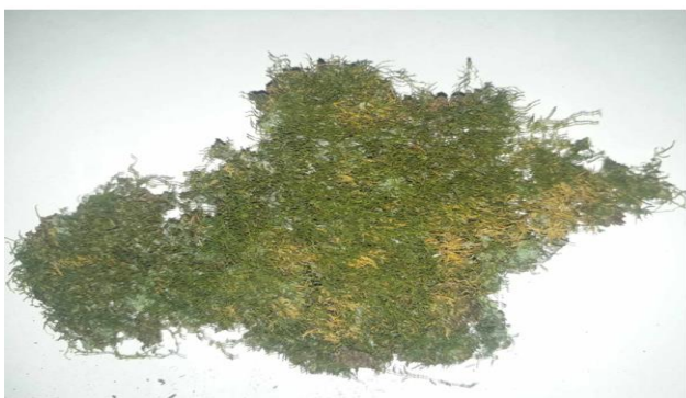
Figure 15: Morphological features of Pelekium velatum Mitt.