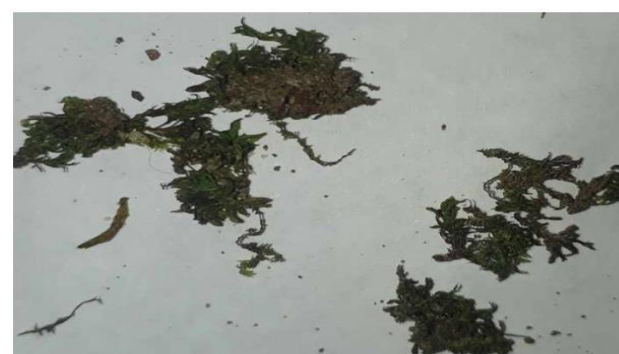
Figure 7: Morphological features of Hyophila involuta (Hook.) A. Jaeger