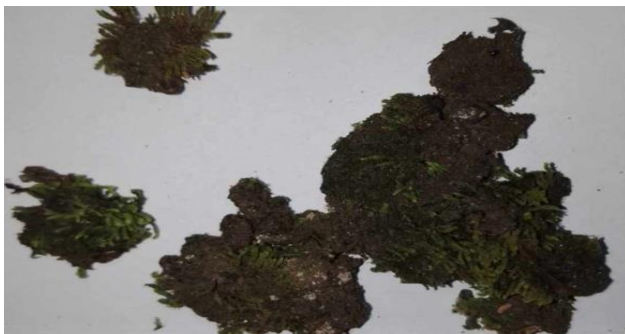
Figure 11: Morphological features of Philonotis laxissima (C.M.) Bryol. Jav.