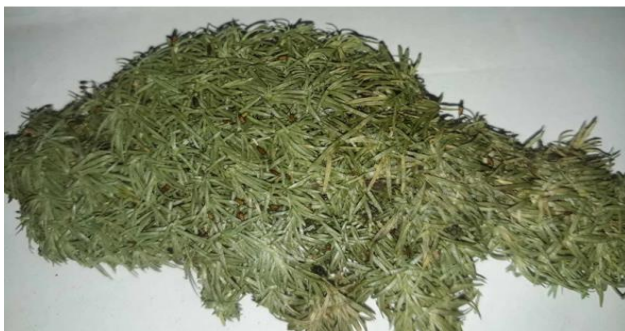
Figure 12: Morphological features of Octoblepharum albidum (Hedw.)