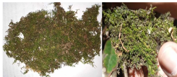
Figure 3: Morphological features of Thuidium investe (Mitt.) Jaeg.