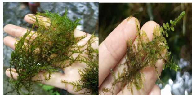
Figure 6: Morphological features of Vesicularia montagne (Bel.) Broth.